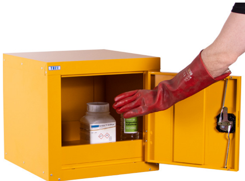
Fully CoSHH Compliant Cupboard