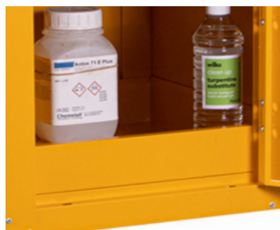
13 Litre sump capacity